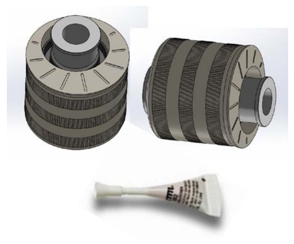
Rear Wishbone Lower Weather Sealed Monoball Kit

Our fully sealed monoball cartridge kits feature maintenance free PTFE linings requiring no supplemental lubrication. We've designed in weather seals to keep dirt out and extend product life. This is the only monoball suitable for street or extended track use. Dirt and water contaminate ordinary products and accelerate wear.